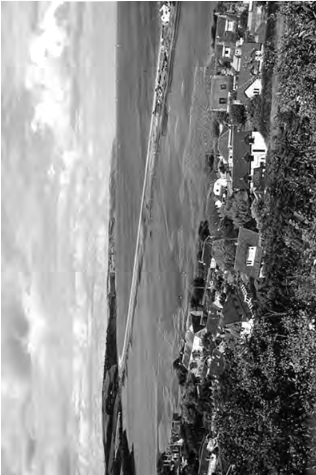
Photograph A for Question 3 (a)